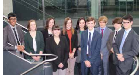
The full list of the new student roles are as follows: