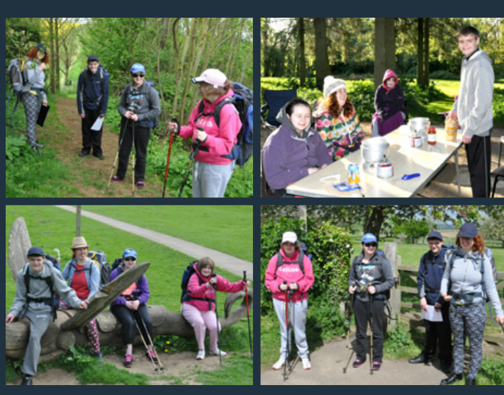
Our Year 12 students on their expedition