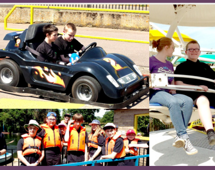
Our students have fun at Wicksteed Park