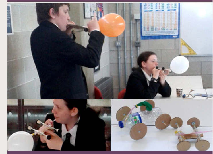
Our engineers create balloon powered cars