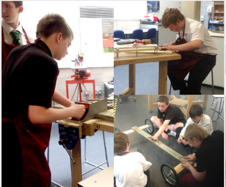
Our designers take on the Greenbull Challenge

Our students took part in exciting trips and activities during our second Manor, Duxford Imperial War Museum, Twycross Zoo and Wicksteed Park. In school we also ran a variety of sessions, including the Greenbull Challenge, which challenged students to design and make soapbox go-karts which were then entered into races, and a project to make balloon powered cars.