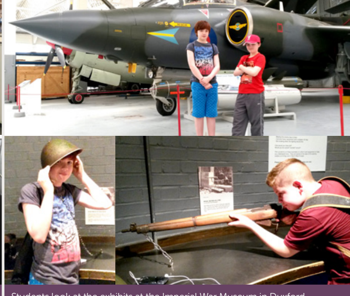
Students look at the exhibits at the Imperial War Museum in Duxford