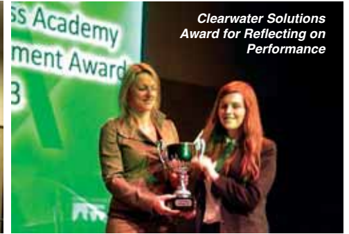
Clearwater Solutions Award for Reflecting on Performance