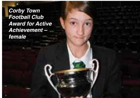
Corby Town Football Club Award for Active Achievement – female