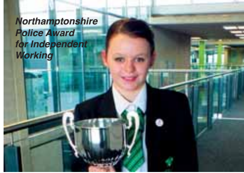
Northamptonshire Police Award for Independent Working