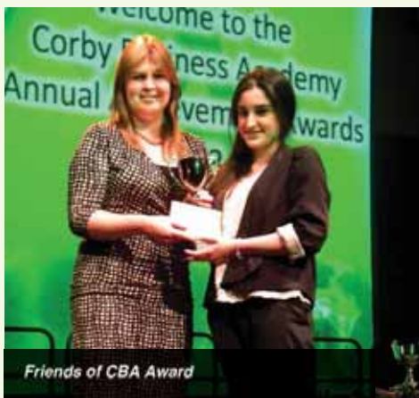
Friends of CBA Award

See more photographs from the Achievement Awards on pages 10 & 11.