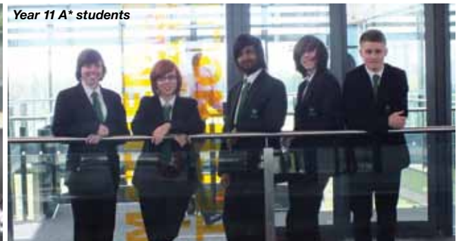
Year 11 A* students