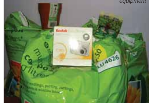
The new Gardening Club equipment

The Club, which meets during Session 3 on alternate Tuesdays, has also seen its equipment stores boosted thanks to the aid of students and parents who donated Let it Grow Vouchers.