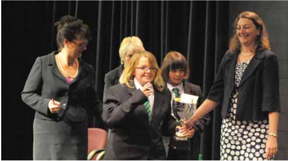
Inclusion Enterprise Group