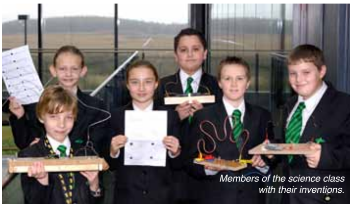
Members of the science class with their inventions.