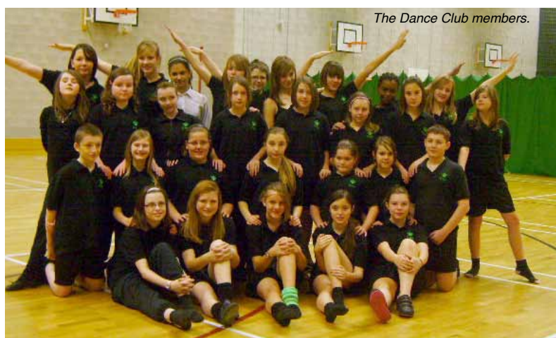
The Dance Club members.

"The students were great in the Christmas Show and I look forward to seeing further progress."