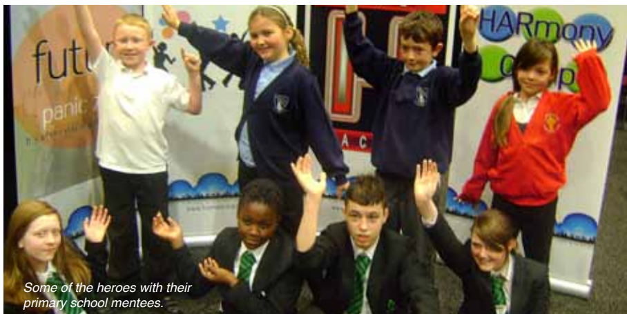
Some of the heroes with their primary school mentees.