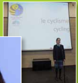
One of the students taking part in the French final