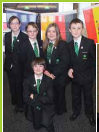
The students who represented CBA at the event