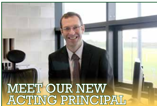
Deputy Executive Principal, Brooke Weston Partnership