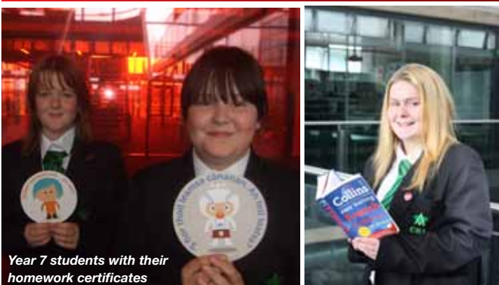
Year 7 students with their homework certificates