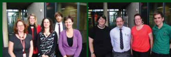
Some of the new staff at CBA