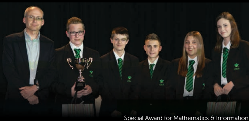
Special Award for Mathematics & Information Technology winners E-Safety Challenge Group