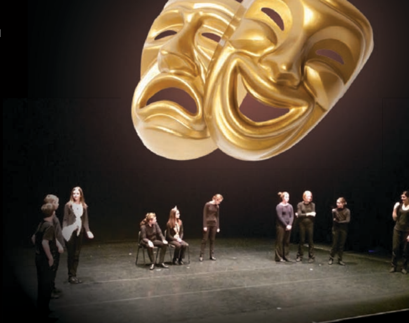
Our students perform Hamlet at The Core theatre in Corby

"Having a female Hamlet was one of the many interesting choices that we made which gave the students the opportunity to really explore the characters.