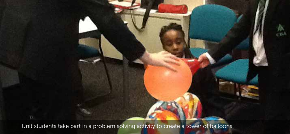
Unit students take part in a problem solving activity to create a tower of balloons