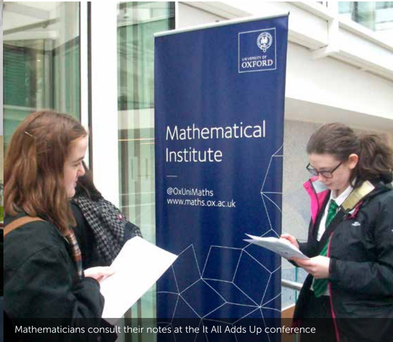
Mathematicians consult their notes at the It All Adds Up conference