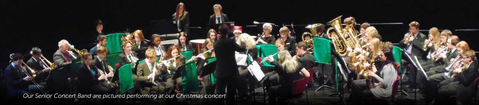
Our Senior Concert Band are pictured performing at our Christmas concert