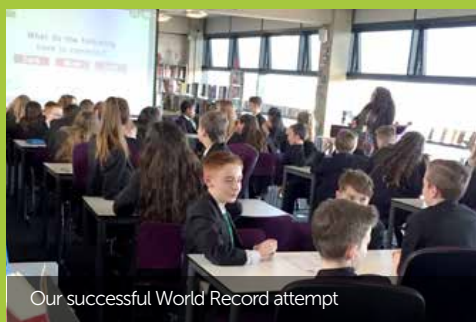
Our successful World Record attempt