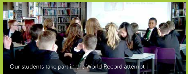
Our students take part in the World Record attempt