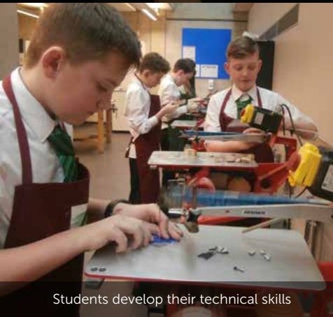
Students develop their technical skills