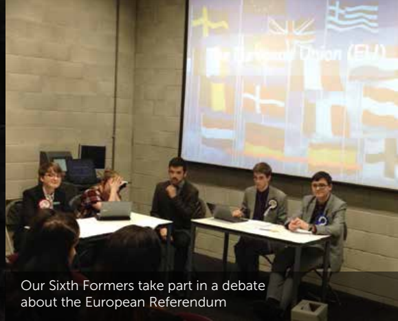
Our Sixth Formers take part in a debate about the European Referendum