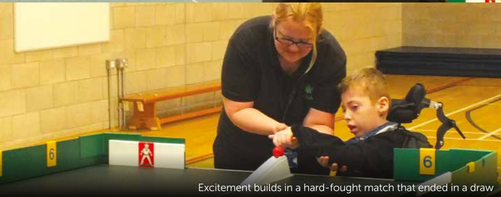
Excitement builds in a hard-fought match that ended in a draw