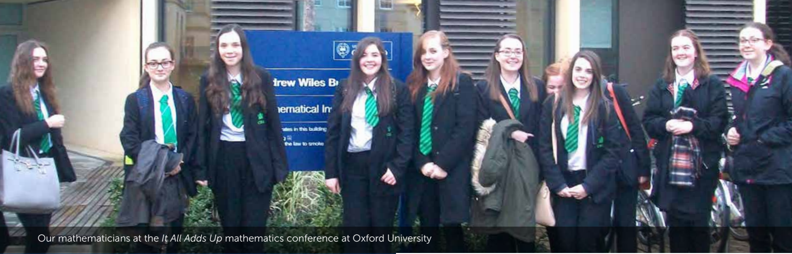
Our mathematicians at the It All Adds Up mathematics conference at Oxford University