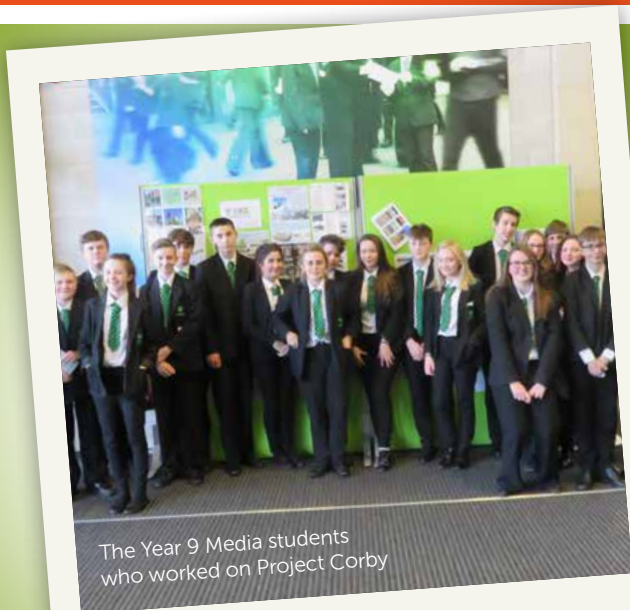
The Year 9 Media students who worked on Project Corby

To go to the Doodle website visit www.doodlelearn.co.uk