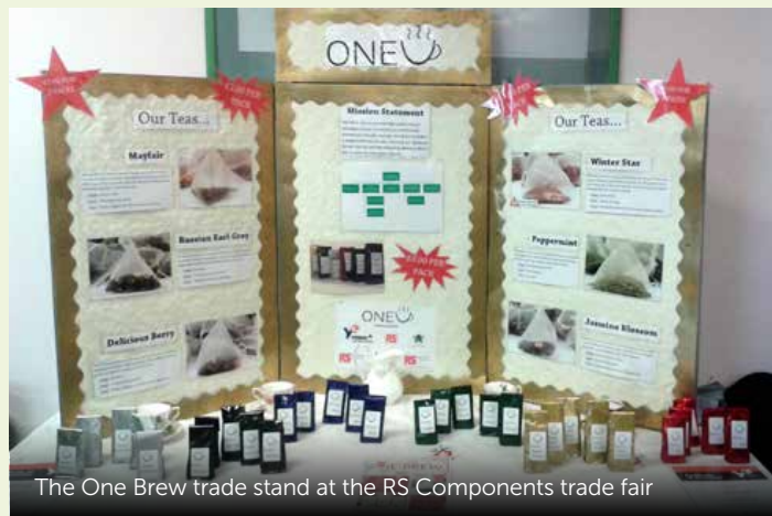
The One Brew trade stand at the RS Components trade fair