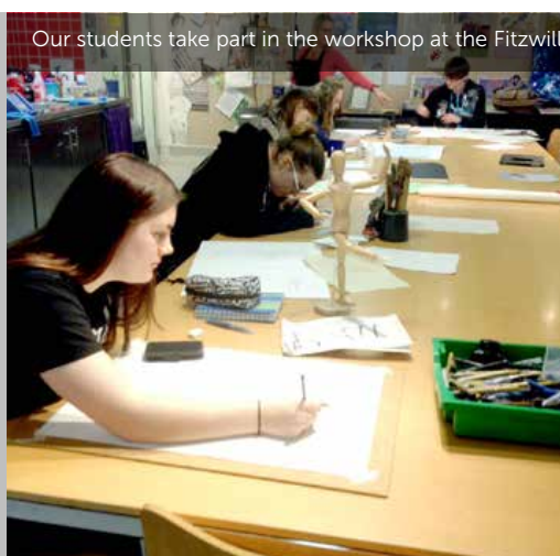
Our students take part in the workshop at the Fitzwilliam Museum

Pictures of the students taking part in the workshop are on display on the museum's website.