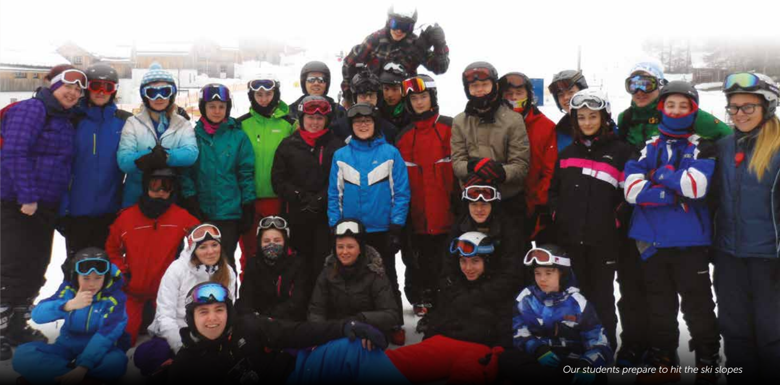
Our students prepare to hit the ski slopes