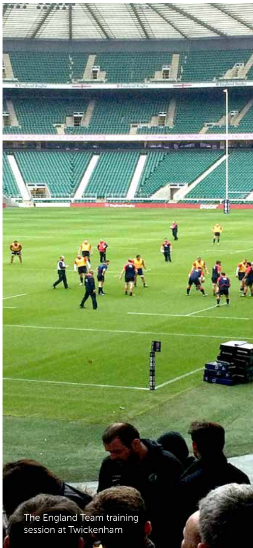
The England Team training session at Twickenham