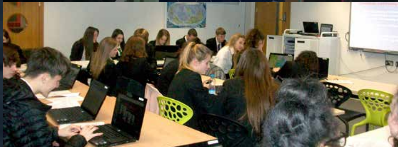
Students attend the Digital Research workshop at the British Library