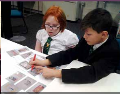
Unit students take part in the Ready, Steady, Cook challenge