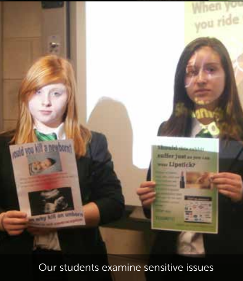
Our students examine sensitive issues