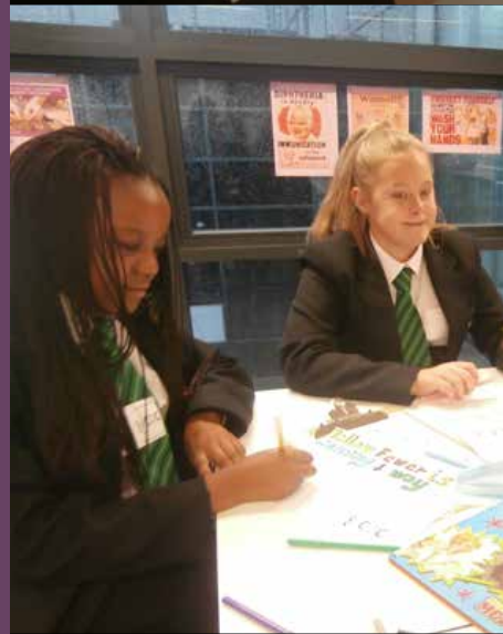
Students take on a range of challenging activities during Curriculum Day