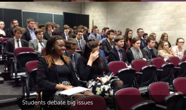
Students debate big issues