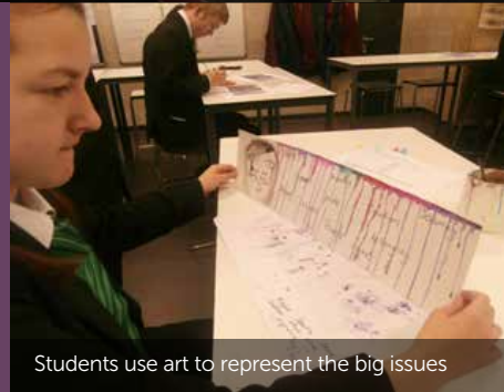
Students use art to represent the big issues

These included creating a tower from balloons and producing a pasta dish from a small number of ingredients in a Ready, Steady, Cook challenge.