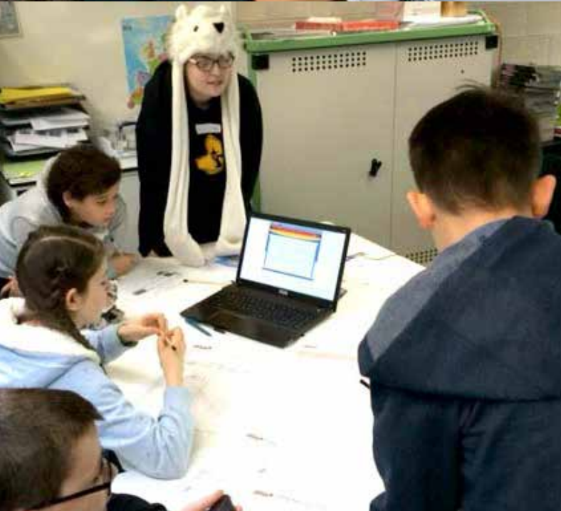
Students take part in the National Space Centre's Operation Montserrat exercise