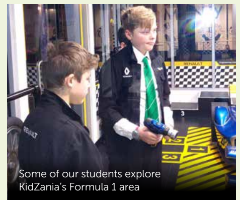
Some of our students explore KidZania's Formula 1 area

"There were lots of exciting opportunities inside. For example, in the British Airways area there was a lifelike flight simulator experience.