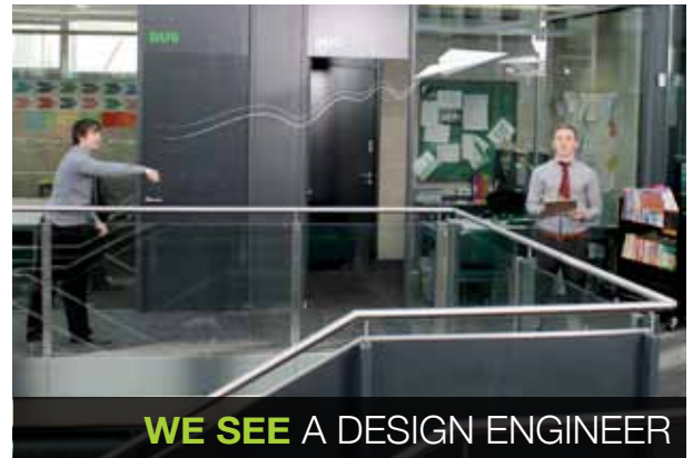
WE SEE A DESIGN ENGINEER