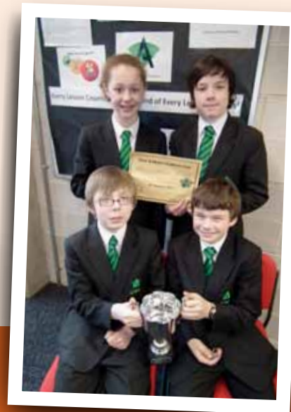
Some of the Maths whizzes