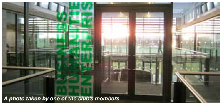
A photo taken by one of the club's members