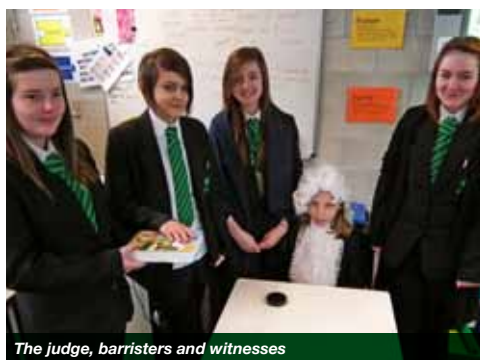
The judge, barristers and witnesses