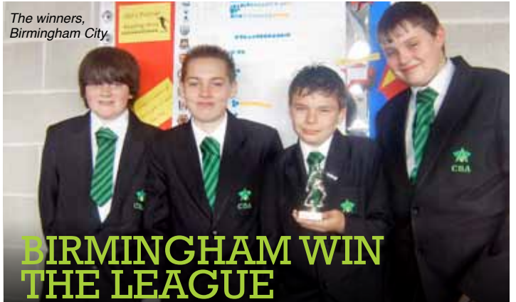
The winners, Birmingham City

"I'm so passionate about reading and I want to pass my passion on."