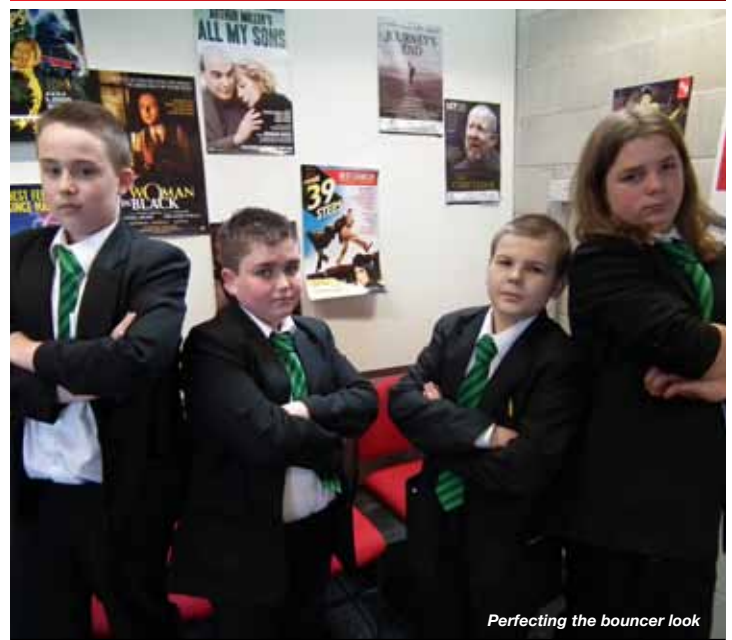
Perfecting the bouncer look

It promises to be a fun and lively performance – more details of the show will be published soon.